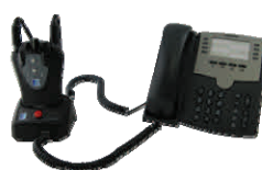
HSE 6010 Telephone Interconnect Kit