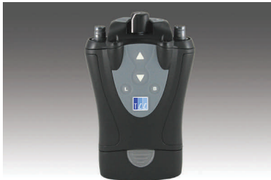
HSE 6000 squad radio headset encryption