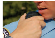
Public Safety, Private Security & Special Operations