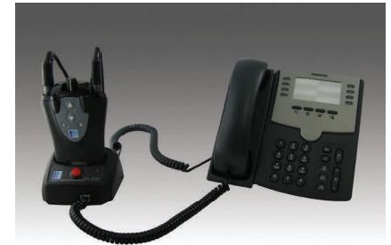
HSE 6000 with Telephone Interconnect Kit

The HSE 6000 Telephone Interconnect Kit (HSE 6010) enables both secure radio to secure telephone communications, and secure telephone-to-telephone communications — point-to-point and conferencing. It supports VoIP, analog and digital telephone networks, and is ideal for connecting commanders and government officials to field personnel.