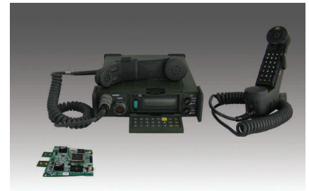
DSP 9000 handset, base model and implant board

DSP 9000 secure radio encryption is available in base station, manpack, radio-embedded, and handset configurations. It uses a Digital Signal Processor to ensure exceptional recovered voice quality and cryptographic security. It is also a universal secure radio encryption solution, operating with most radio makes and models, and seamlessly overlaying on existing voice networks for cost-effective end-to-end security. The DSP 9000 has many years of proven in-use performance around the world, and interoperates with the HSE 6000 radio headset and telephone encryptor.